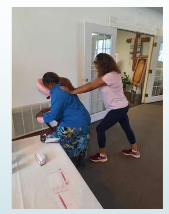
A guest at the conference having chiropractic treatment