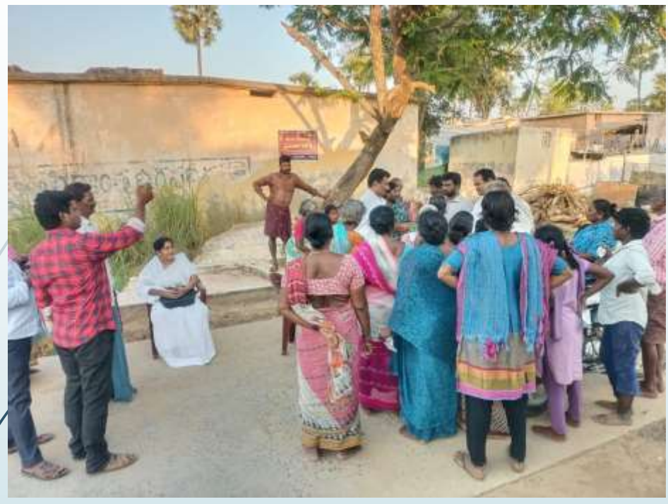
VILLAGERS GATHERING FOR THE MEDICAL CAMP IN APRIL