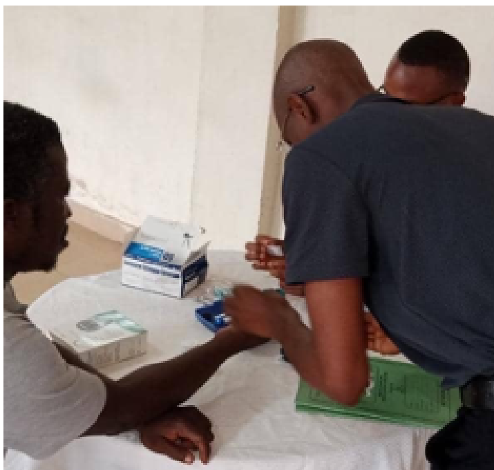
A MAN HAVING HIS BLOOD SUGAR CHECKED