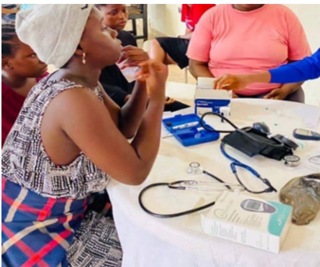
SOME WOMEN WAITING TO BE EXAMINED