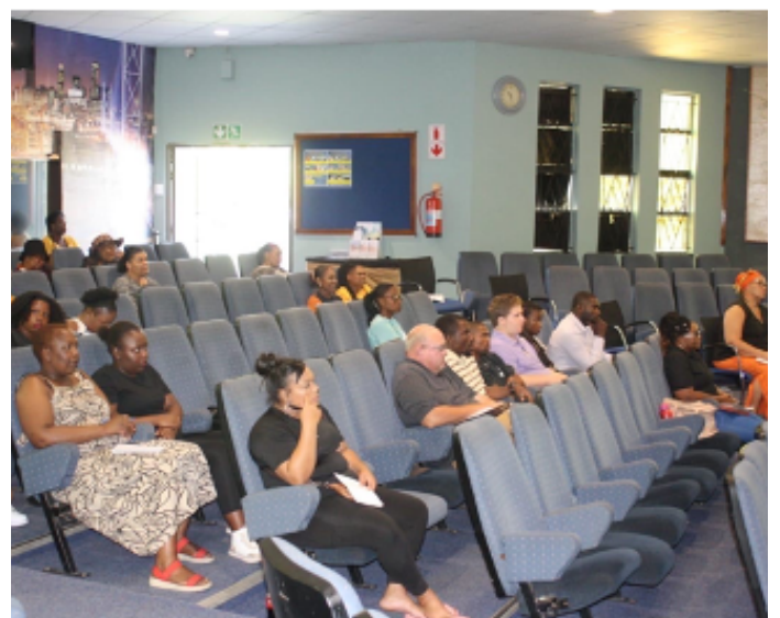
MORE PARTICIPANTS AT THE TRAINING DAY