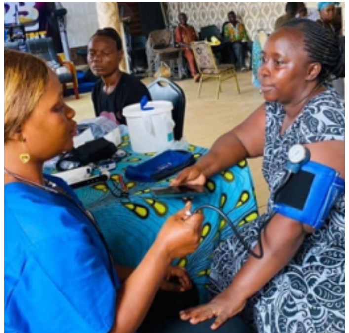
A LADY HAVING HER BLOOD PRESSURE TAKEN AT THE HEALTH DAY