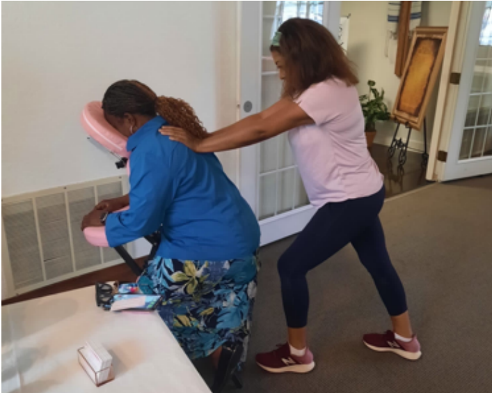
CHIROPRACTIC TREATMENT IN PROGRESS