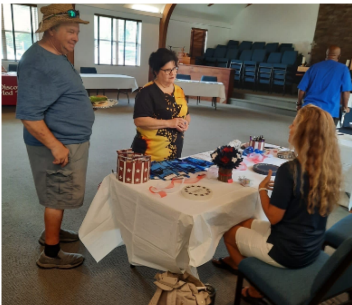
TWO GUESTS ATTENDED TO AT THE HEALTH FAIR