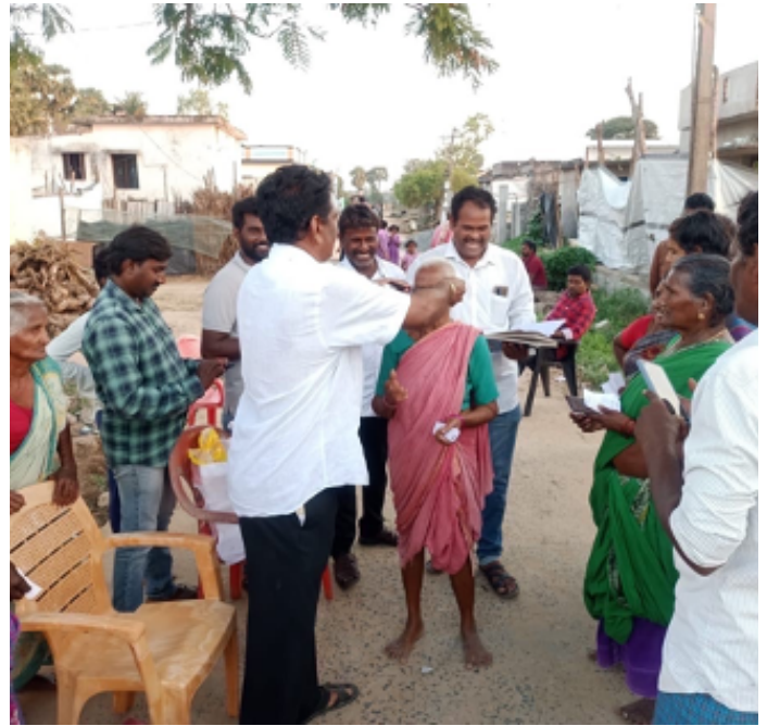
AN ELDERLY LADY BEING FITTED WITH SPECTACLES