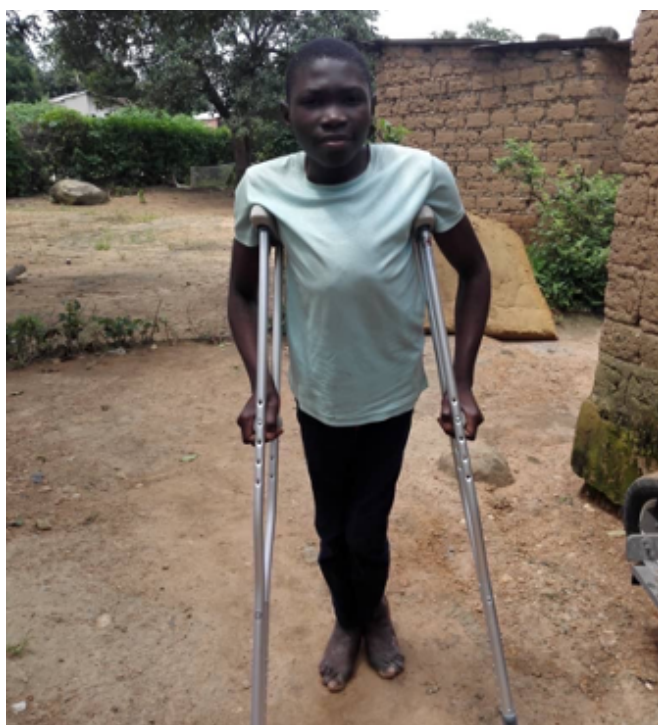
THE 18-YEAR-OLD BOY WITH HIS NEW CRUTCHES.

An 18-year-old boy in the Ndola district in Zambia, born with a disability that caused paralysis of his lower limbs and who also at 2 years of age developed a hump (curvature of his chest wall) was presented with a pair of crutches donated CHM in partnership with TTN. The boy who suffers from longstanding chest pain relies on medication from time to time to help ease his pain. Provision of the crutches not only helps to alleviate his suffering but also enables him to move around and maintain some form of independence as he relies mainly on his mother for support having previously lost his father.