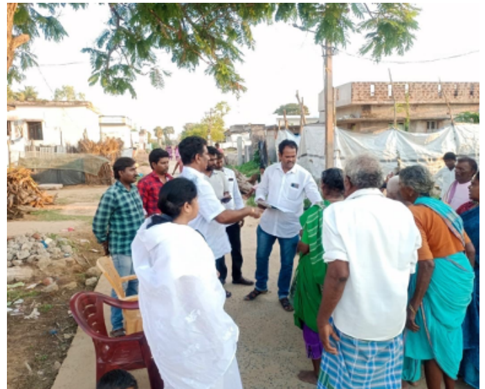
A CROSS-SECTION OF THE VILLAGERS AT THE MEDICAL CAMP