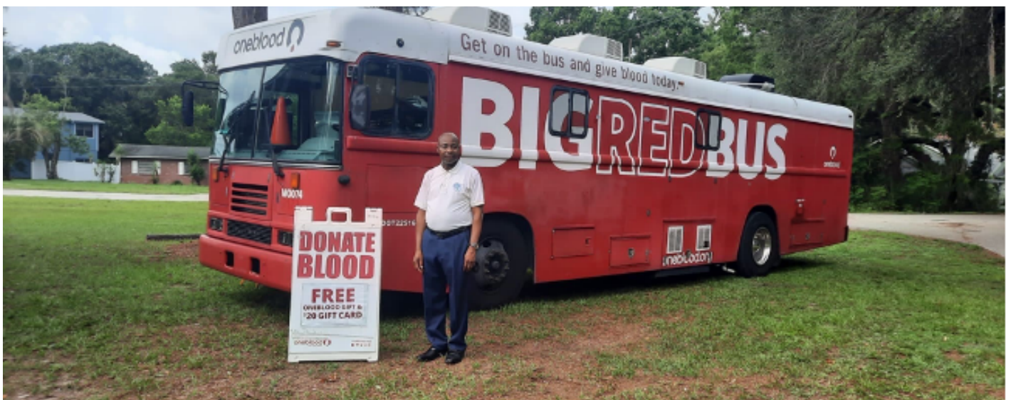
THE MOBILE BLOOD DONATION BUS