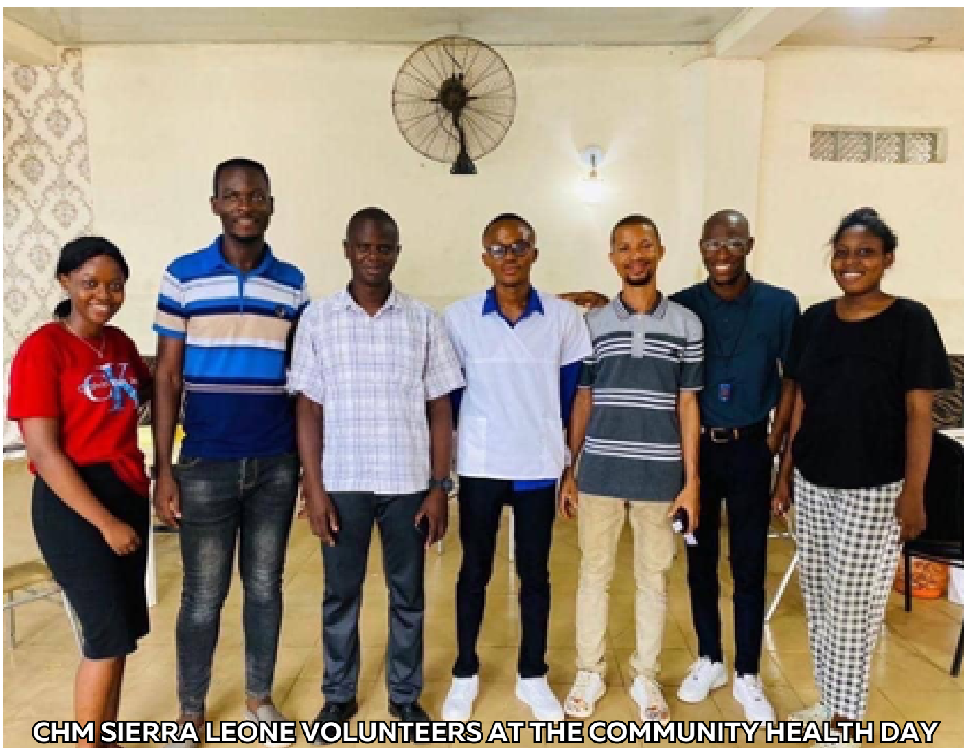
CHM SIERRA LEONE VOLUNTEERS AT THE COMMUNITY HEALTH DAY