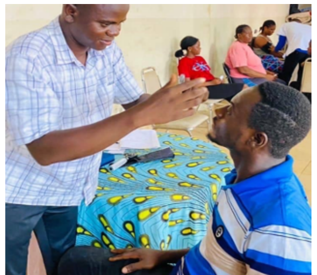
A CHM VOLUNTEER BEING SEEN BY THE HEALTH TEAM