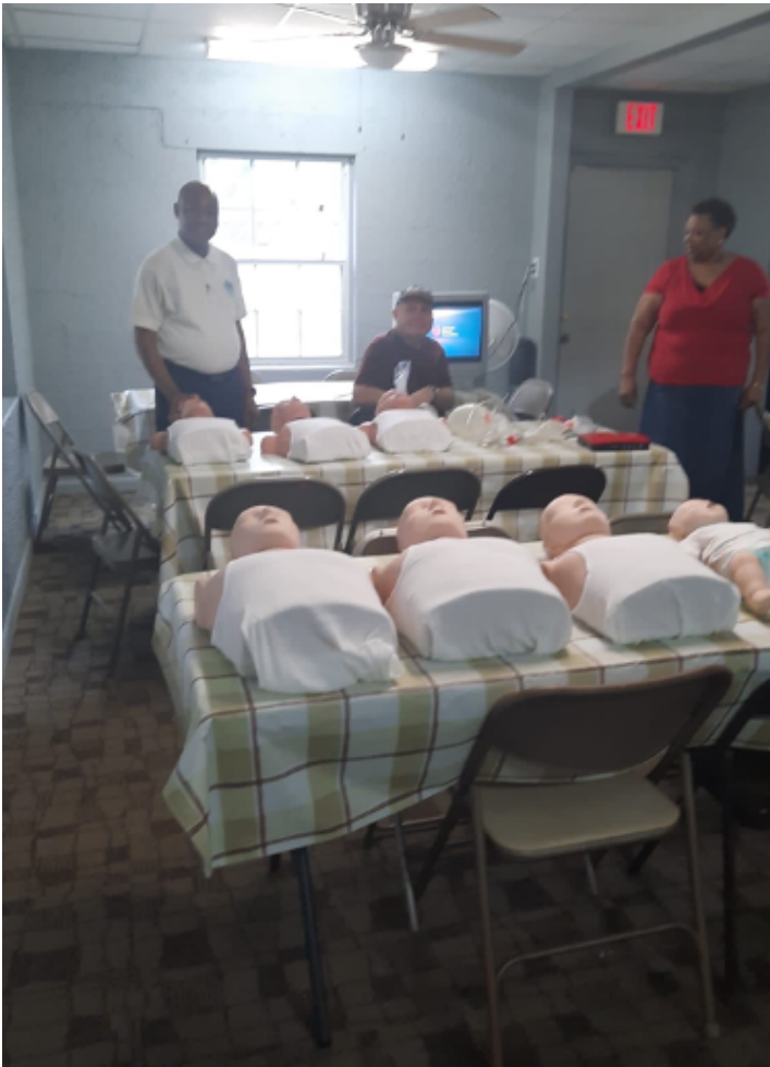
DUMMIES USED FOR CPR TRAINING