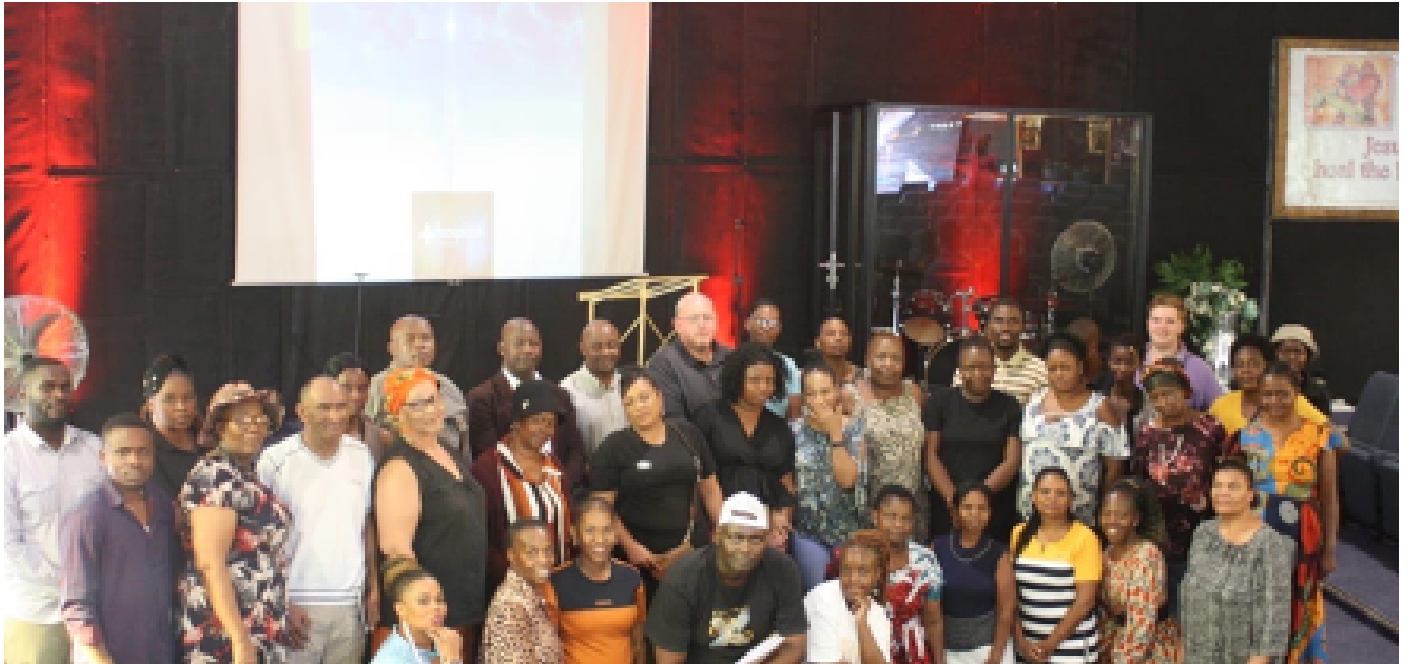
VOLUNTEERS AT THE TRAINING DAY OF CHM SOUTH AFRICA