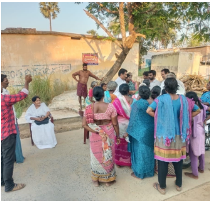
VILLAGERS GATHERING FOR THE MEDICAL CAMP

CHM India medical camp took place on the 11th of April 2023 in the village of ....This comes on the heels of their annual conference held between the 23rd and 24th of February. On the recommendation made to our volunteers following their annual conference, one hundred recipients were presented with reading glasses. Now, this is something many of us in privileged parts of the world may take for granted but for the less privileged in these parts, it is Godsend. Kudos to our tireless colleagues in India for yielding themselves to God to be used this way. And glory be to God for His goodness and mercy that endure forever.