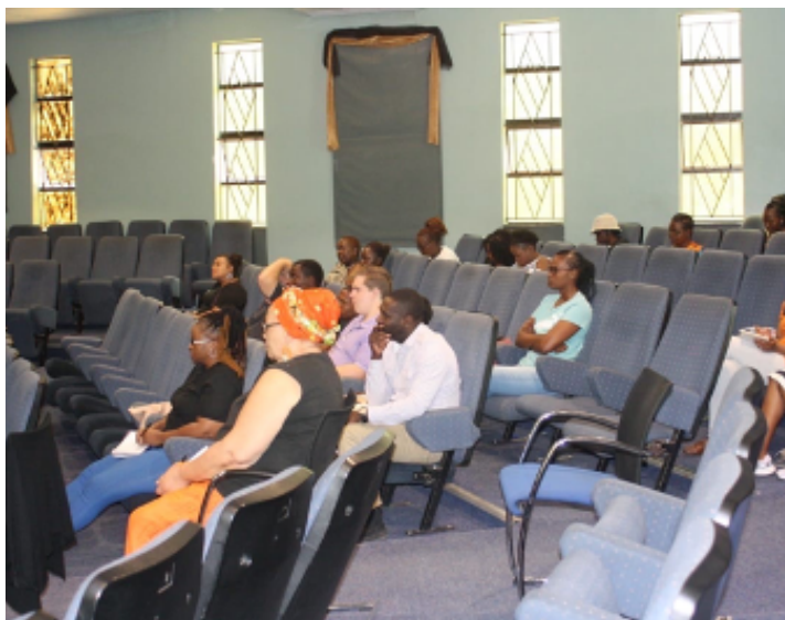
PARTICIPANTS AT THE TRAINING DAY