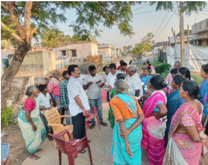
THE VILLAGERS GATHER FOR THE MEDICAL CAMP