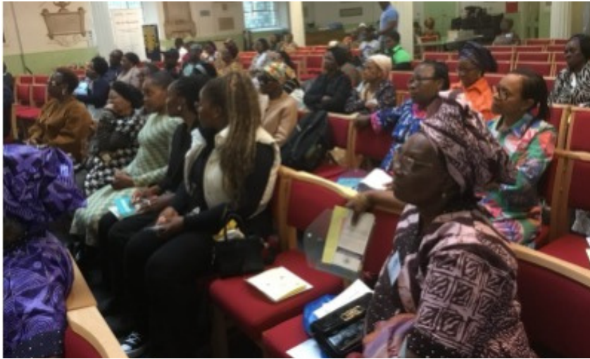
A CROSS SECTION OF DELEGATES AT THE CONFERENCE