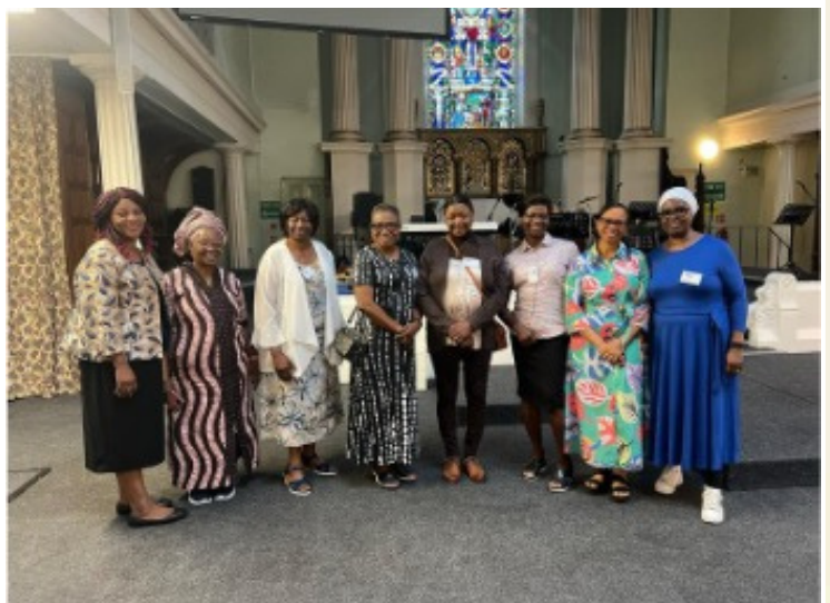
THE CLINICAL TEAM AT THE CONFERENCE