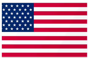
U. S. A.