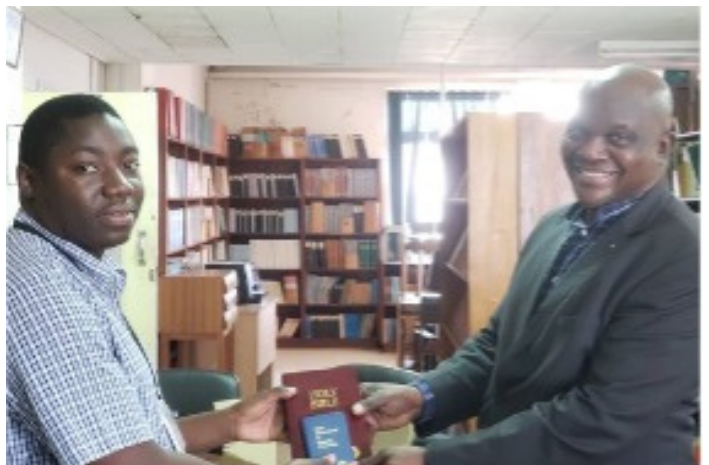
A PATIENT (LEFT) RECEIVING A COPY OF THE BIBLE & NEWS TESTAMENT