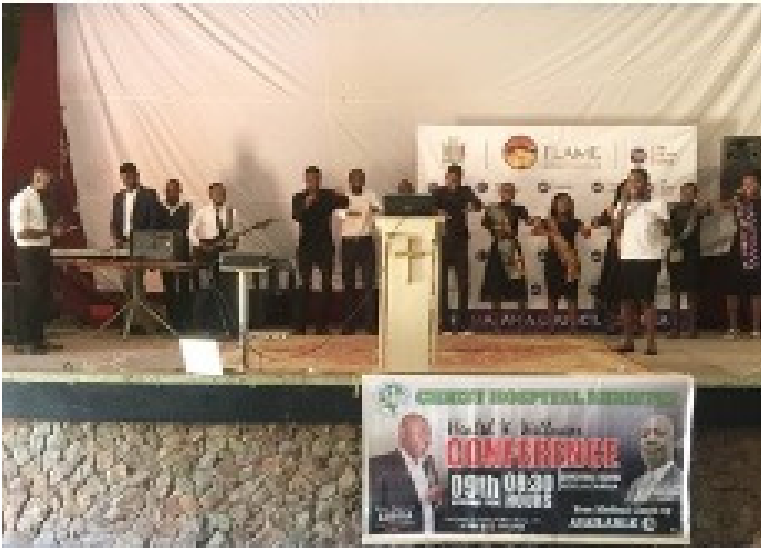
WORSHIP TIME AT THE CONFERENCE