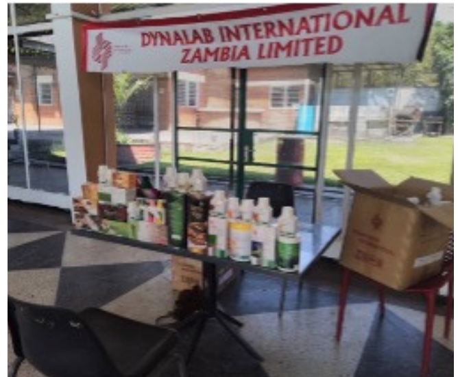
MEDICATIONS PROVIDED BY DYNALAB INTERNATIONAL