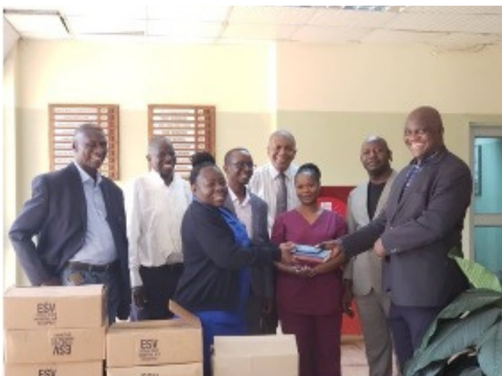
PRESENTATION OF COPIES OF THE BIBLE TO THE WARD SISTER