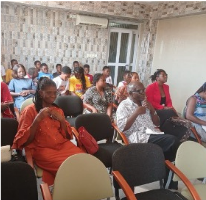
PARTICIPANTS AT THE EVENT