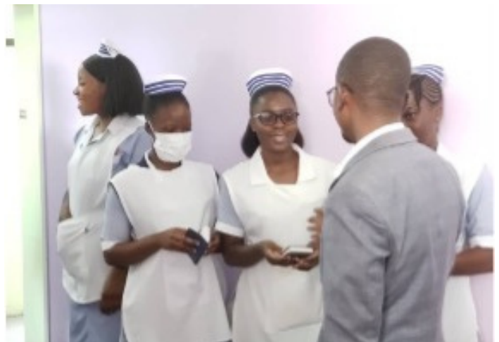
NURSES ON THE WARD WELCOMING AN OFFICIAL OF GIDEONS INTERNATIONAL