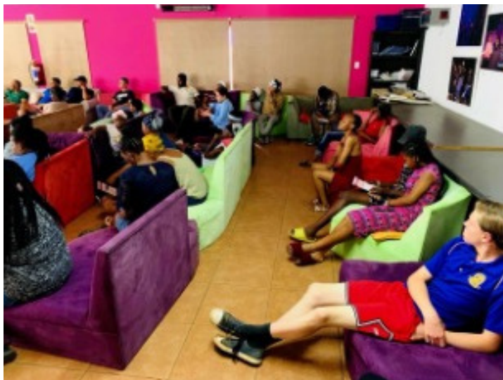
PARTICIPANTS AT THE WELLNESS CONFERENCE