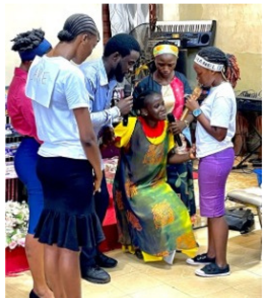
MELODRAMA GROUP IN ACTION