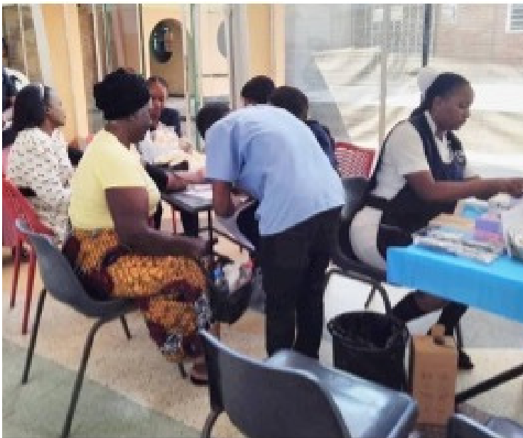
PARTICIPANTS WAITING TO BE SEEN BY THE NURSE