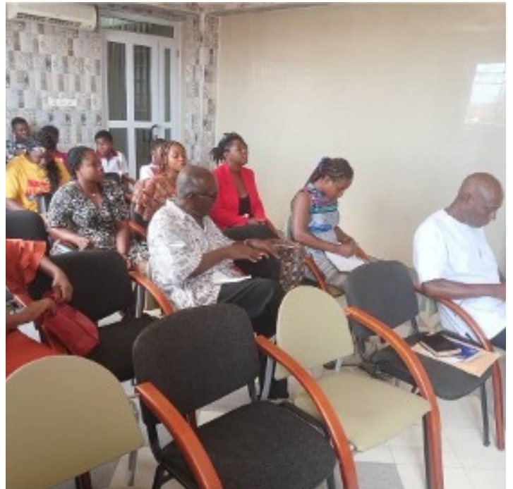
PARTICIPANTS AT THE EVENT