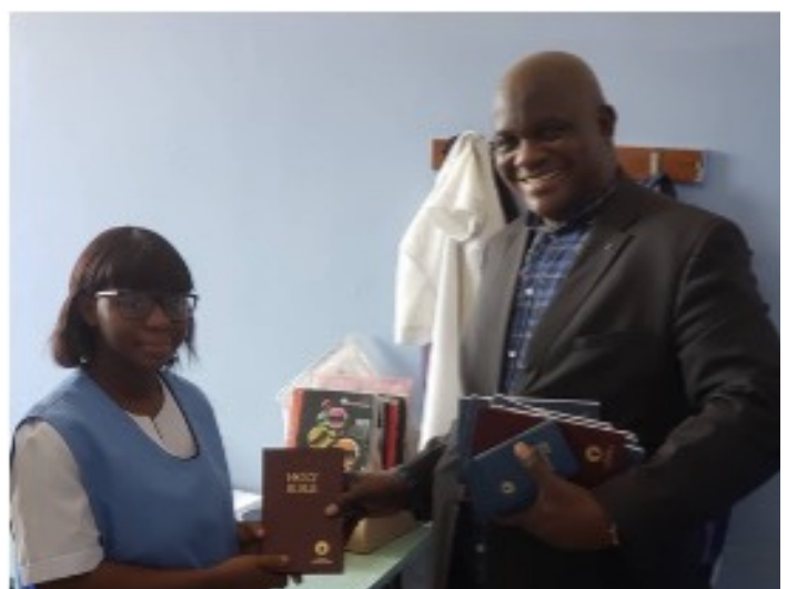
A NURSE RECEIVING A COPY OF THE 'GOOD BOOK'