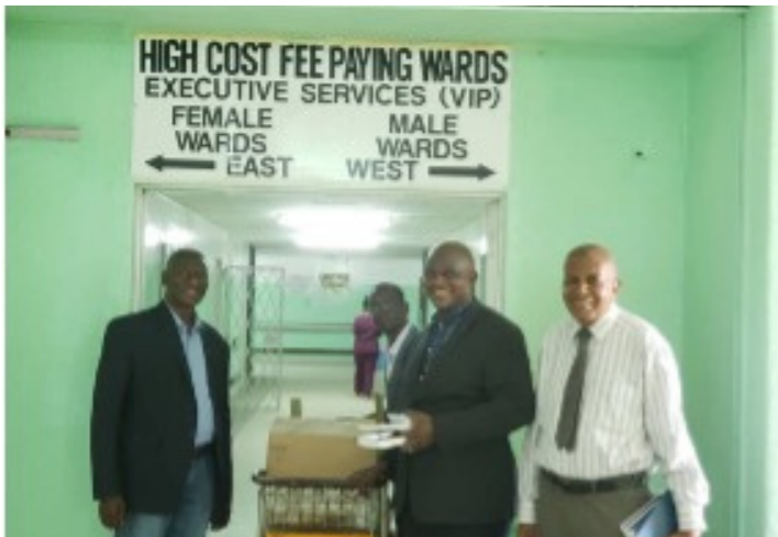
MEMBERS OF GIDEONS INTERNATIONAL IN THE HOSPITAL