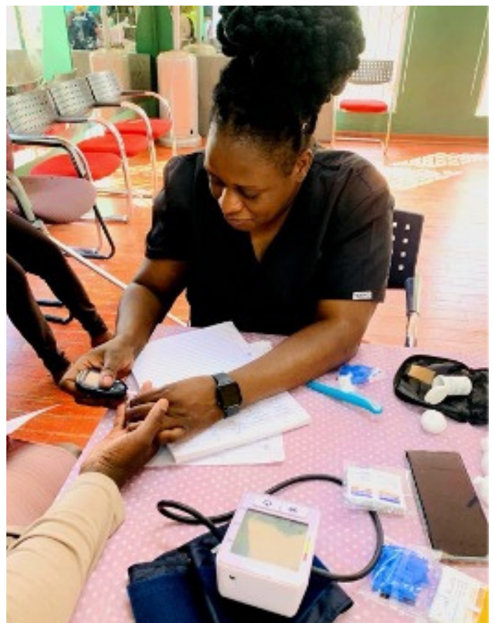
BLOOD SUGAR TEST IN PROGRESS