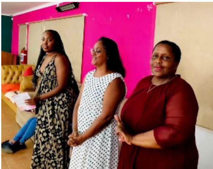
SOME SPEAKERS AT THE CONFERENCE