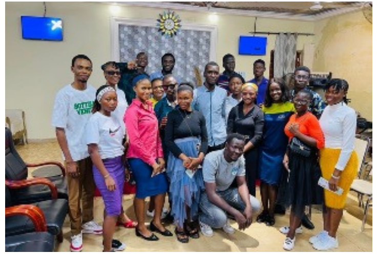
GLOBAL MELODRAMA TEAM