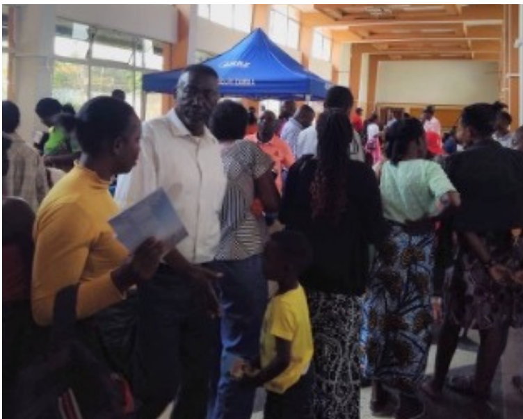
PARTICIPANTS AT THE ZAMBIAN CONFERENCE