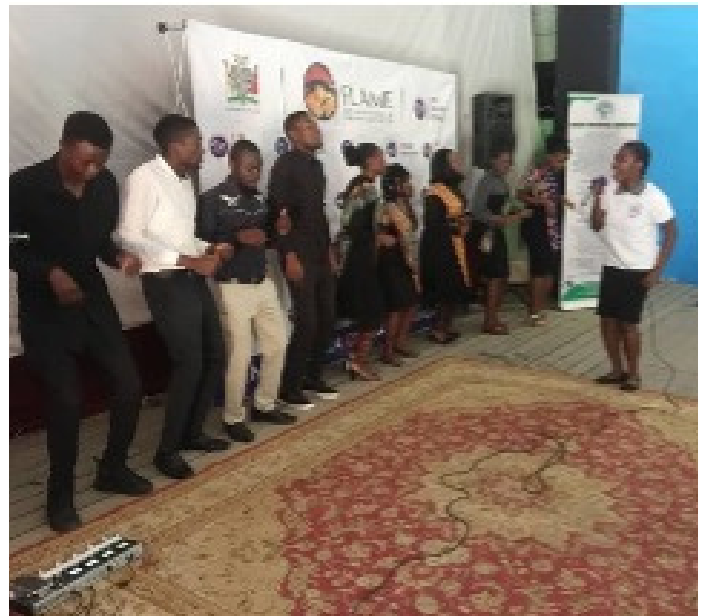
PERFORMANCE BY THE DRAMA GROUP AT THE CONFERENCE