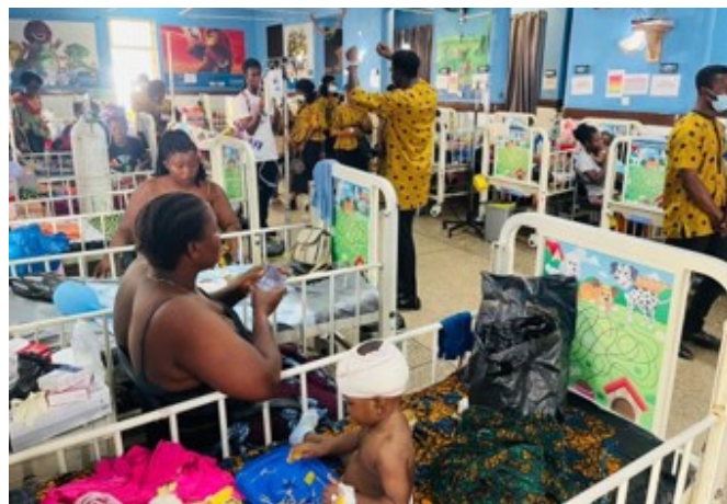
More volunteers on the children's ward