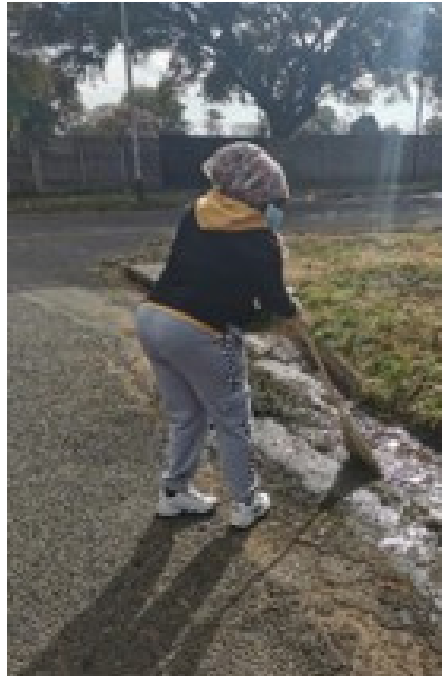
Even the cold weather is not going to stand in the way of these volunteers