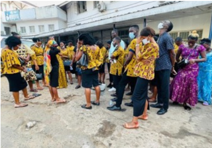
CHM volunteers gathered and praying outside the hospital

This outreach reaffirms Christ Hospital Ministry's commitment to serving humanity with compassion and faith. The visit to Connaught Hospital served not only to meet physical needs but also to bring hope and comfort to the sick. The Ministry remains dedicated to following Christ's example of love in action.