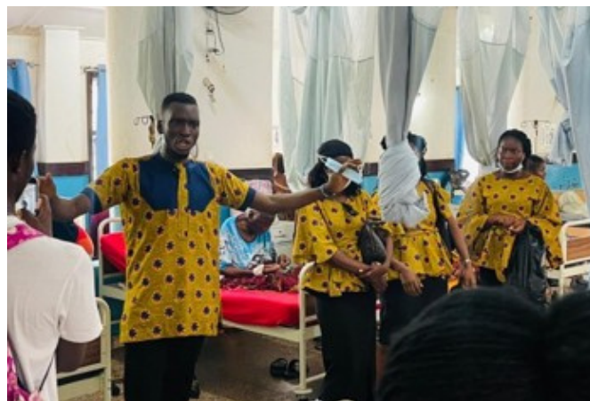
Ministration on a medical ward in Connaught Hospital adult