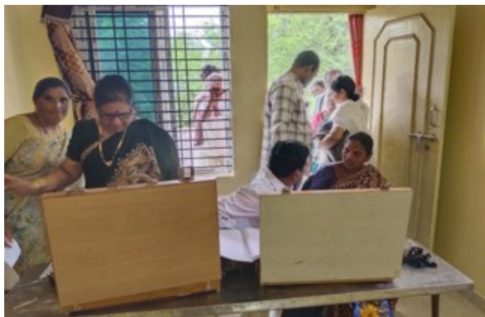
Medical team setting up at CHM India Medical Camp

This year as in other years, free medications and spectacles were provided to many of the poor villagers who attended the conference. The village sarpanch (local head) was also in attendance at the medical camp and they also helped out at the camp. We give Almighty God, our Heavenly Father for yet another successful conference.