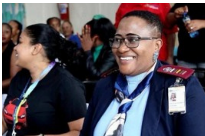
A light-hearted moment during the prayer conference