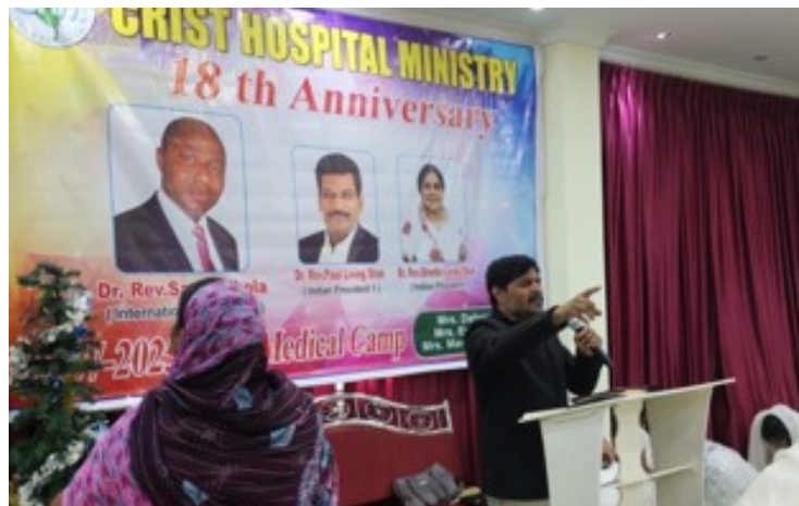
Ministration time at the conference