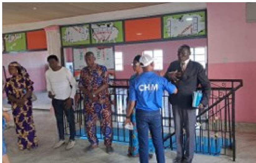
CHM Nigeria volunteers at Re-event School