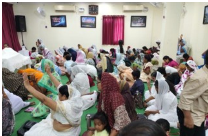
Female congregants worshipping at CHM India conference