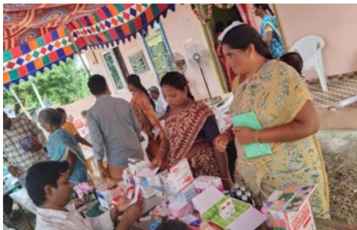
Two female participants collecting drugs at the camp