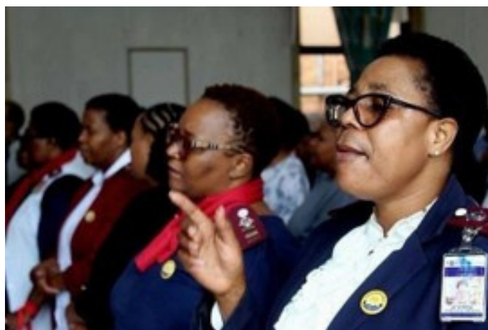
Some women praying at the prayer conference