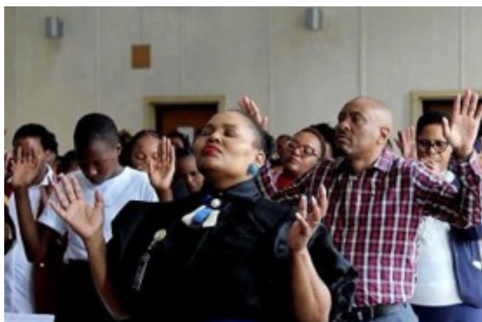
Congregants raising up holy hands in prayer