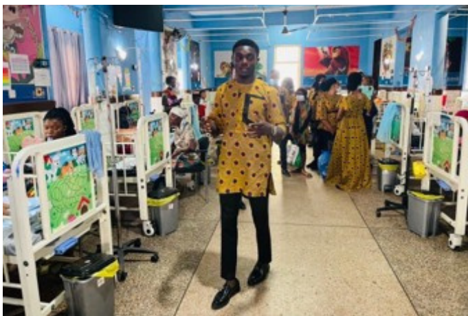
CHM volunteers on the paediatric ward to minister to patients