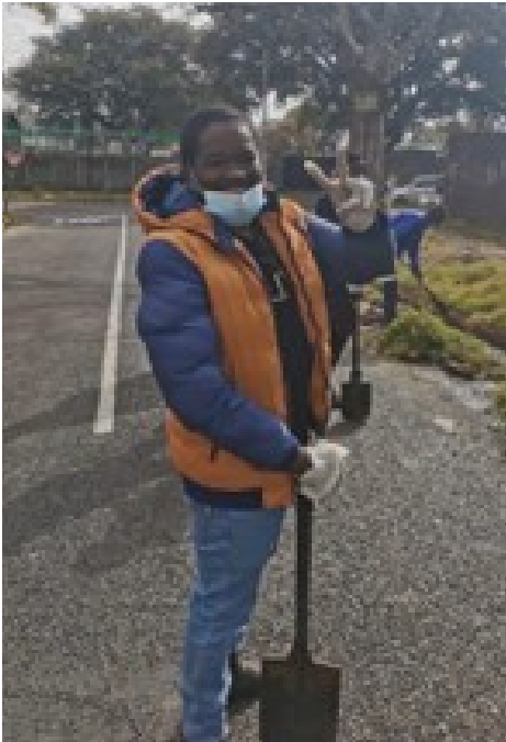
A volunteer ready to muck in.