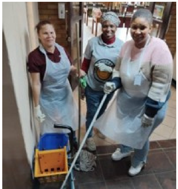
Making sure the inside is spick and span