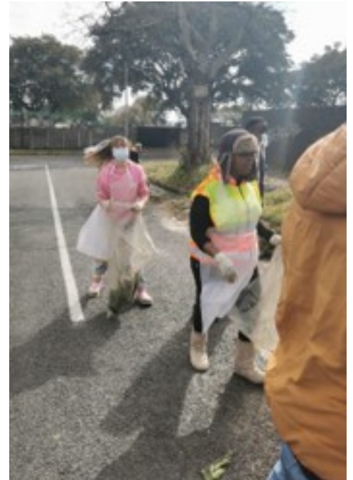
A female volunteer hard at work