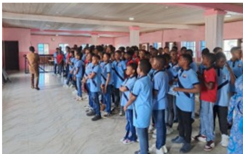
A cross section of students of Re-event school, Iba