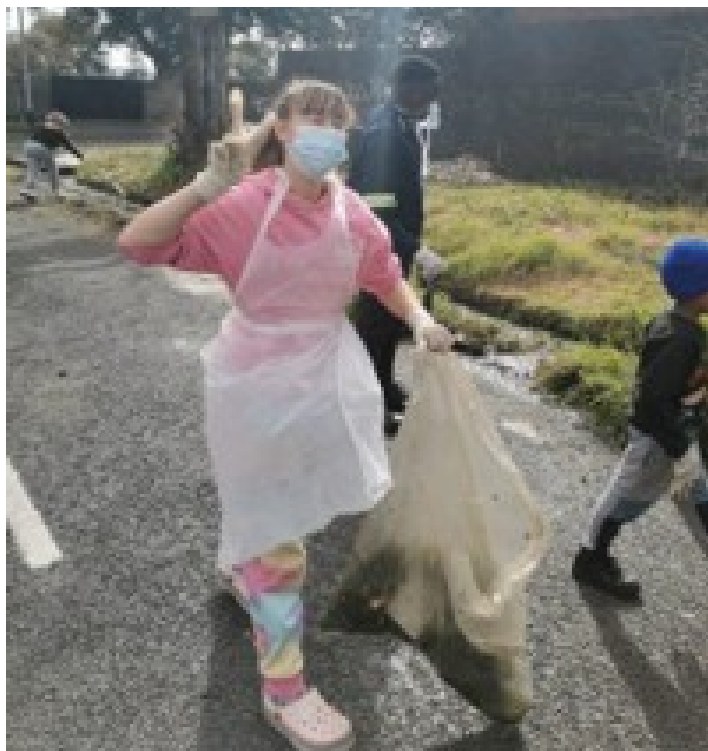
Yes, lady, peace be unto you too