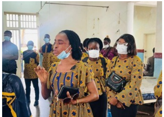
CHM volunteers ministering on a ward hospital