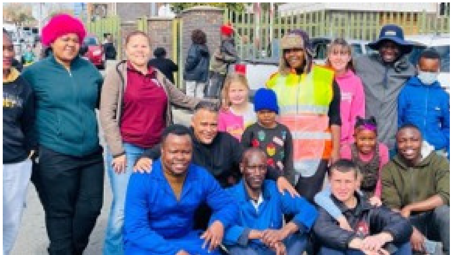
All for one and one for all