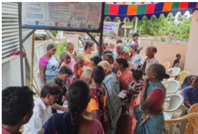
Participants at CHM India medical camp