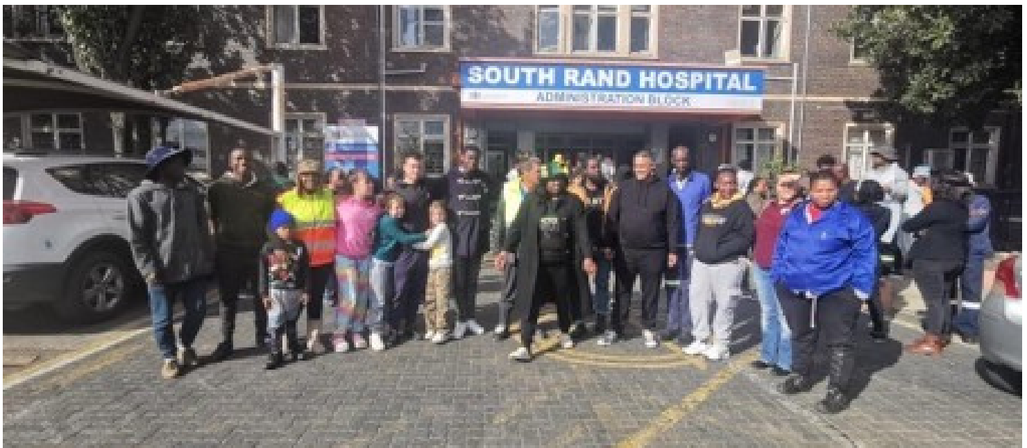
The army of volunteers outside South Rand Hospital