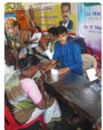
A lady having her blood pressure measured at the medical camp