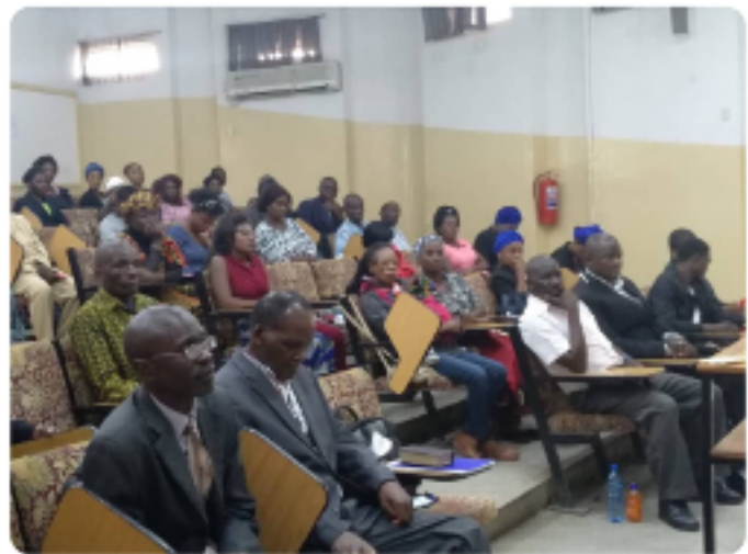
CHM volunteers at the training seminar

“ Last December about 30 patients equating to almost half of a particular ward gave their lives to Christ and 17 patients received healing following prayers.. ”