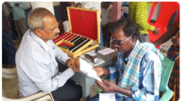
A delegate having an eye test at the medical camp