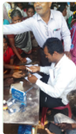
A delegate having their blood sugar checked