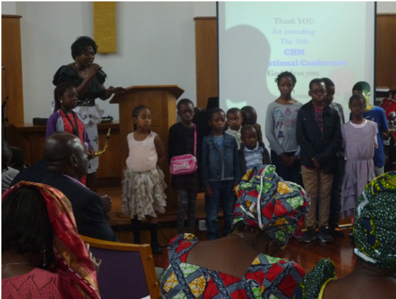
A prayer session for children at the Conference

This year registered a phenomenal increase in the number of volunteers working with CHM UK with the number now totalling 53.