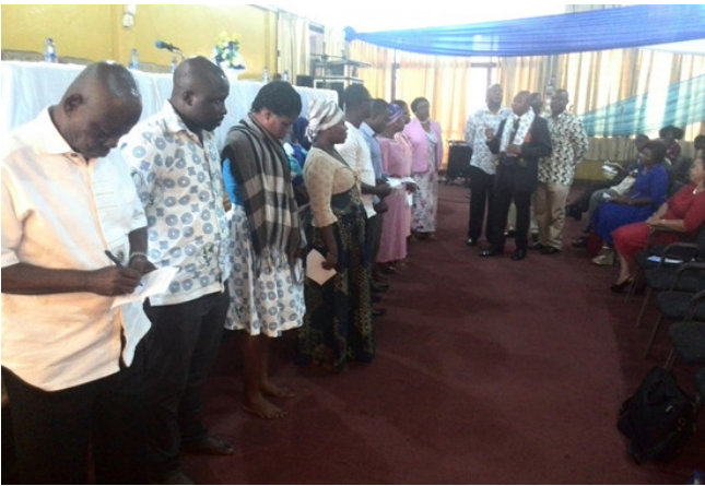
Prayer for new volunteers at the CHM Ghana Conference in August 2015

Christ Hospital Ministry, Ghana reports that 2,250 people were ministered to in the 2014/2015 season. In the same season, 112 home visits and 2,138 hospital visits were undertaken while 700 bibles were distributed in the hospitals. The work of the ministry in Ghana continues to progress, thanks to our ever dedicated team of volunteers and of course the blessing of God over their efforts.