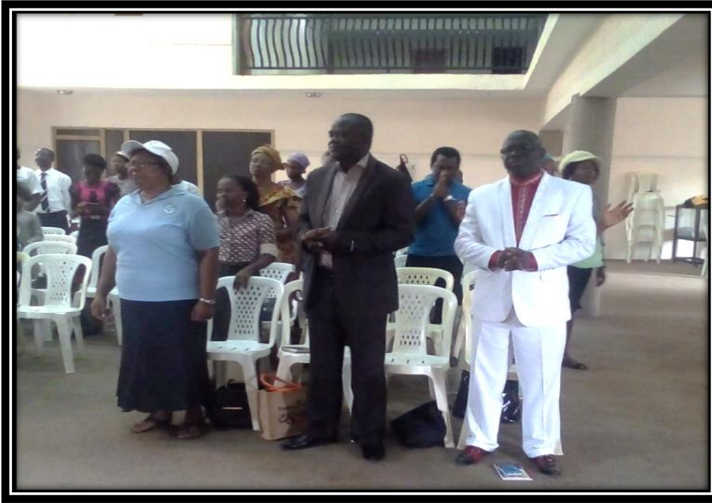
CHM NIGERIA LAUNCHES NEW BRANCH IN IKORODU LAGOS. GLORY BE TO GOD!!